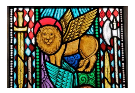
Challenge yourself to produce a handwritten copy of the book of Mark by Christ the King Sunday, November 25, 2018.

It's only 16 chapters long (678 verses or 11,304 words, subject to the translation and how you treat the 'extra verses' in the last chapter). Break that down to a schedule that works for you; a specific time or day each week, 3.25 weeks per chapter, or about two verses a day. Use a spiral notebook or a journal. Decide if you want a "Red Letter" edition for the words of Christ. Invent your own illustrated manuscript style. Consider reading the book over the next year.