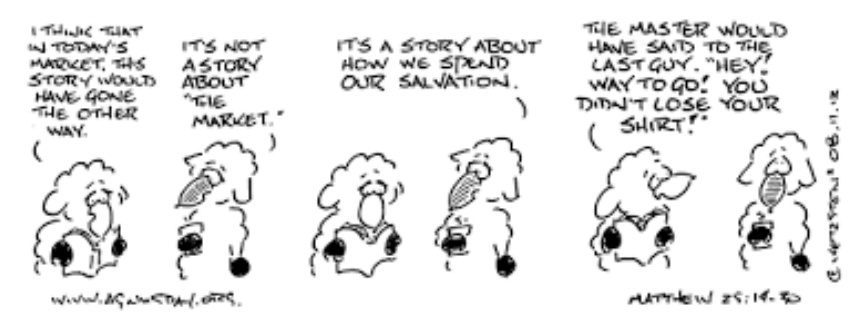
Agnus Day appears with the permission of <u>http://www.agnusday.org/</u> Thanksgiving Day Readings: Deuteronomy 8:1-10, Psalm 67, Philemon 4:6-20 or 1Timothy 2:1-4, Luke 17:11-19

Likewise, the assumed moral of the story is also problematic: (verse 29This moral directly contradicts Amos' warning against those who add field to field and—instead of leaving behind the edges and dropped sheaves for the landless—sell the sweepings of the field. It is contrary to the warnings Jesus issued against greed and his "good news to the poor..." <u>http://www.politicaltheology.com/blog/the-politics-of-the-talents-matthew-2514-30/</u> Political Theology is devoted to studying the intersection between religion, politics and culture.