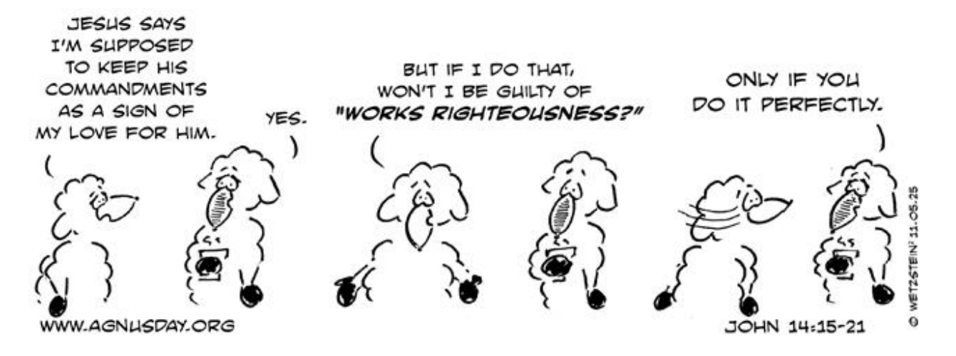
Agnus Day appears with the permission of <a href="http://www.agnusday.org/">http://www.agnusday.org/</a>

"Here at Agnus Day Central, we're defending the doctrine of grace one sin at a time."